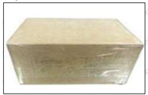
Pic No. 2 Domestic express packaging: Wrapped with Transparent tape